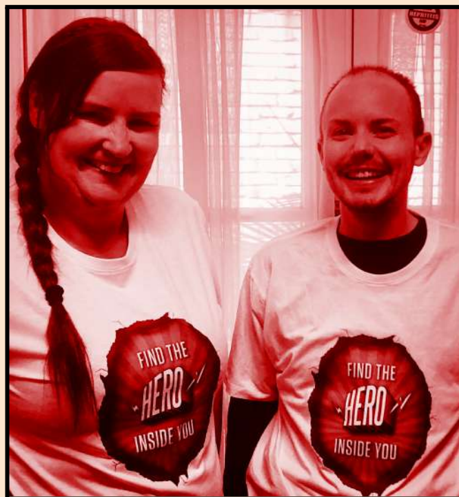
World Hepatitis Day, 28 July 2020, Meanjin Respect Office

We are Queensland sex workers voicing our need for human, industrial and workplace rights for all sex workers. We aim to improve the lives of sex workers by eliminating stigma and discrimination via social, legislative and political change.