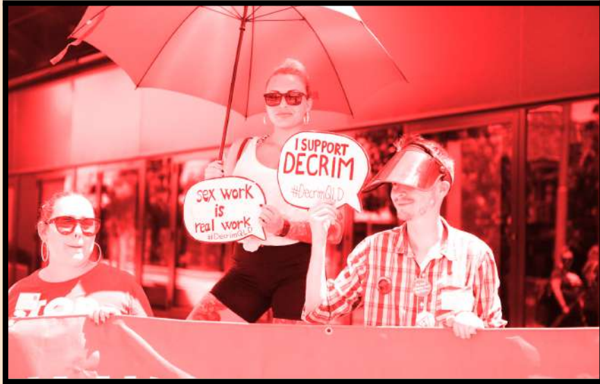
International Sex Worker Rights Day, 3 March 2020, Southport

Read the entire package prior to starting your application.