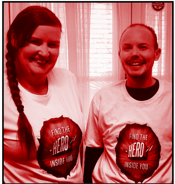
World Hepatitis Day, 28 July 2020, Meanjin Respect Office

We are Queensland sex workers voicing our need for human, industrial and workplace rights for all sex workers. We aim to improve the lives of sex workers by eliminating stigma and discrimination via social, legislative and political change.