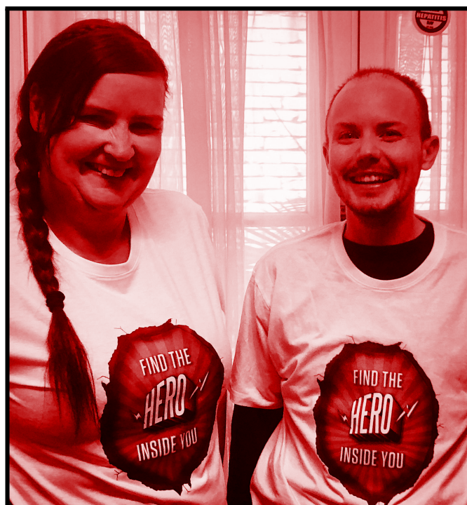
World Hepatitis Day, 28 July 2020, Meanjin Respect Office

We are Queensland sex workers voicing our need for human, industrial and workplace rights for all sex workers. We aim to improve the lives of sex workers by eliminating stigma and discrimination via social, legislative and political change.