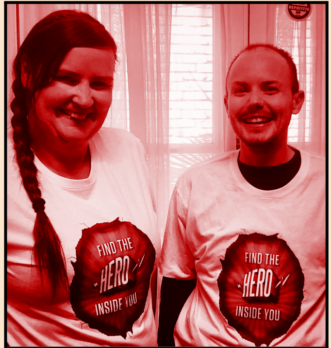
World Hepatitis Day, 28 July 2020, Meanjin Respect Office

We are Queensland sex workers voicing our need for human, industrial and workplace rights for all sex workers. We aim to improve the lives of sex workers by eliminating stigma and discrimination via social, legislative and political change.