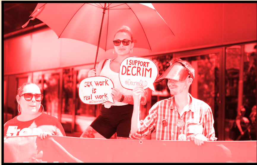
International Sex Worker Rights Day, 3 March 2020, Southport

Read the entire package prior to starting your application.