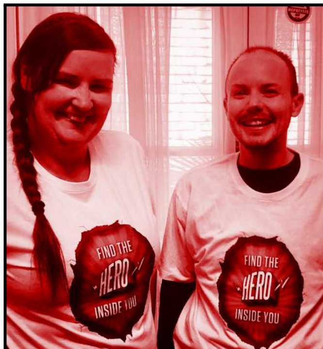
World Hepatitis Day, 28 July 2020, Meanjin Respect Office

We are Queensland sex workers voicing our need for human, industrial and workplace rights for all sex workers. We aim to improve the lives of sex workers by eliminating stigma and discrimination via social, legislative and political change.